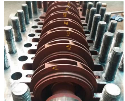
Maintenance on a multistage pumps, disassembly of casing and impellers.