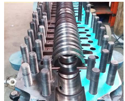
Installation of new wear rings and manufacture of casing gasket.