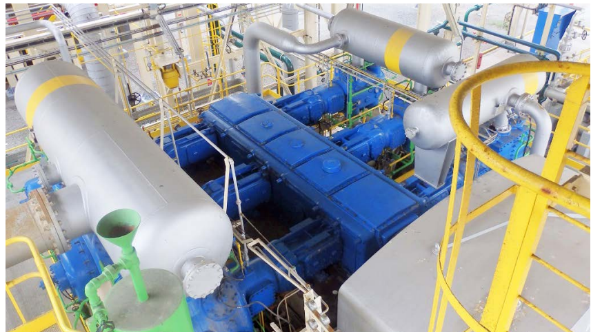
Maintenance work on a reciprocating compressor.

We also have available local manufacturing facilities for urgently needed Baker Hughes spare parts to original specifications with the support of Baker Hughes engineers, also using new materials to increase the efficiency and MTBM and MTBR intervals.