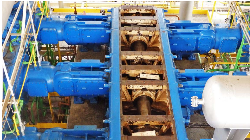
Close-up of reciprocating compressor during maintenance.